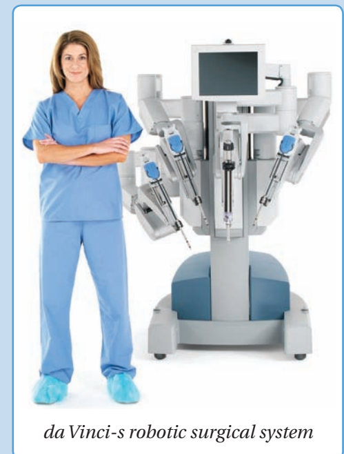
da Vinci-s robotic surgical system